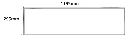
PLVRK12030 - Recessed mount kit