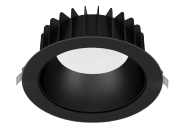
Black reflector UGR25