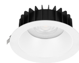
White reflector UGR25