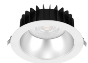
Matt silver reflector UGR25