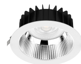
Bright silver reflector UGR19