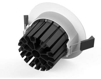
T-shape heat sink increases radiation area for cooling efficiency