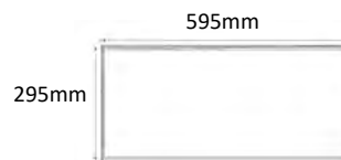
PLVRK6030 - Recessed mount kit